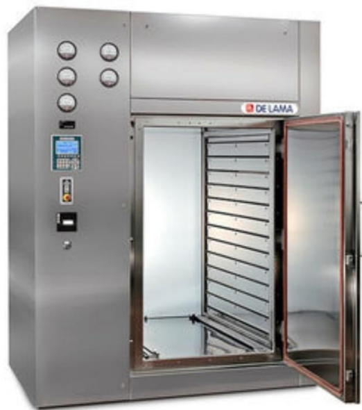
Figure 1: shows Oven device

Heat is generated through sets of electrical resistors transferring this thermal energy to the chamber. These resistors are located in the lower part of the oven and heat is transferred and distributed by natural or forced convection (in oven with internal ventilators). As shown in figure 1.