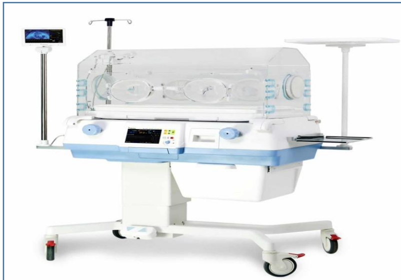
Figure 1: shows infant incubator

Used for Neonates, especially if of low birth weight , born prematurely , if there are other medical conditions , infants that may also have breathing difficulties and for treat jaundice using phototherapy (light sources with wavelength 360 nm is in the near-ultraviolet range).